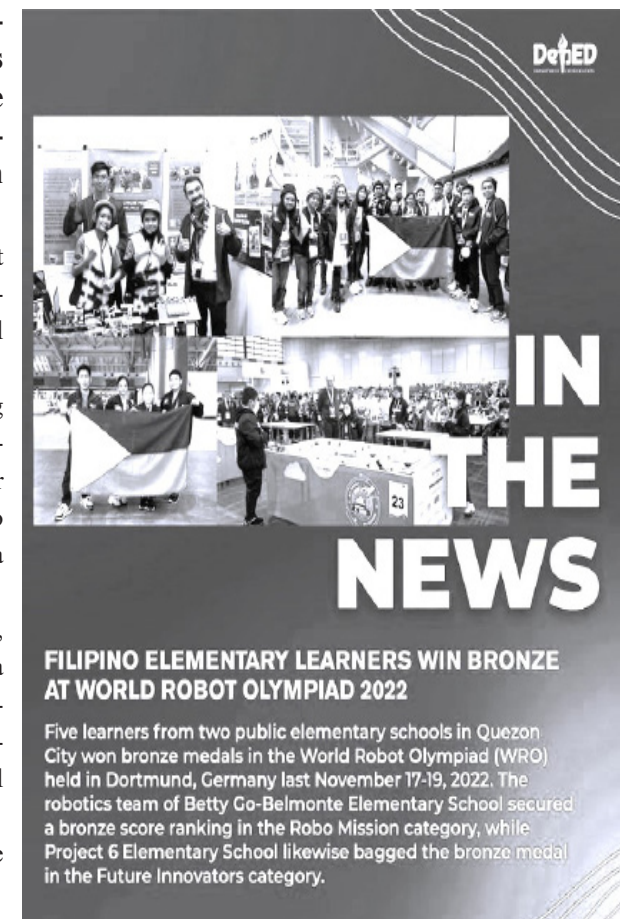
FILIPINO ELEMENTARY LEARNERS WIN BRONZE AT WORLD ROBOT OLYMPIAD 2022

Five learners from two public elementary schools in Quezon City won bronze medals in the World Robot Olympiad (WRO) held in Dortmund, Germany last November 17-19, 2022. The robotics team of Betty Go-Belmonte Elementary School secured a bronze score ranking in the Robo Mission category, while Project 6 Elementary School likewise bagged the bronze medal in the Future Innovators category.